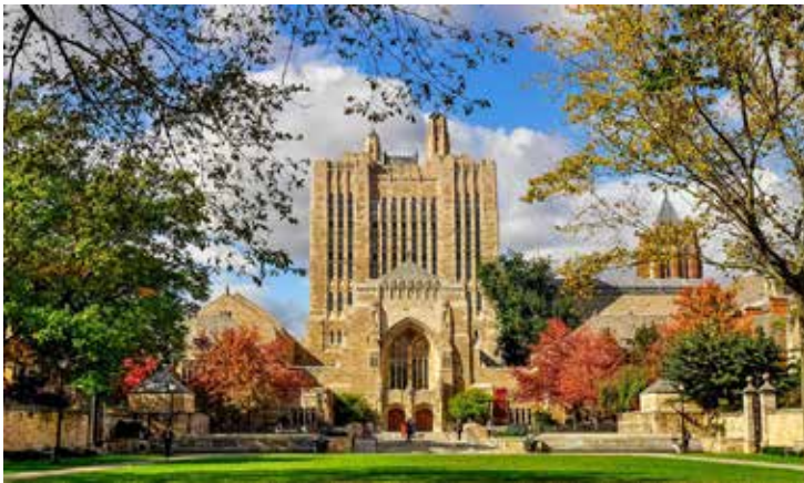
Cross Campus, Yale University