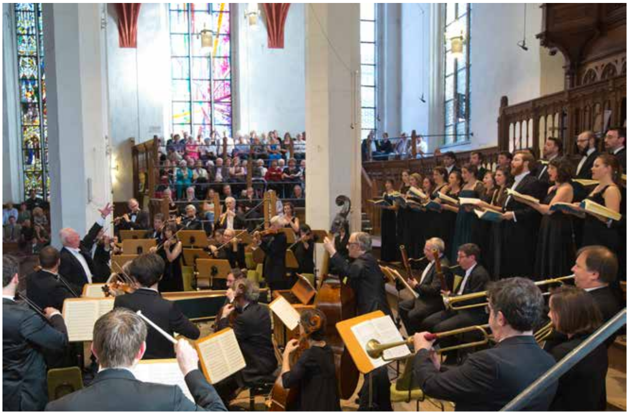
William Christie with Les Arts Florissants