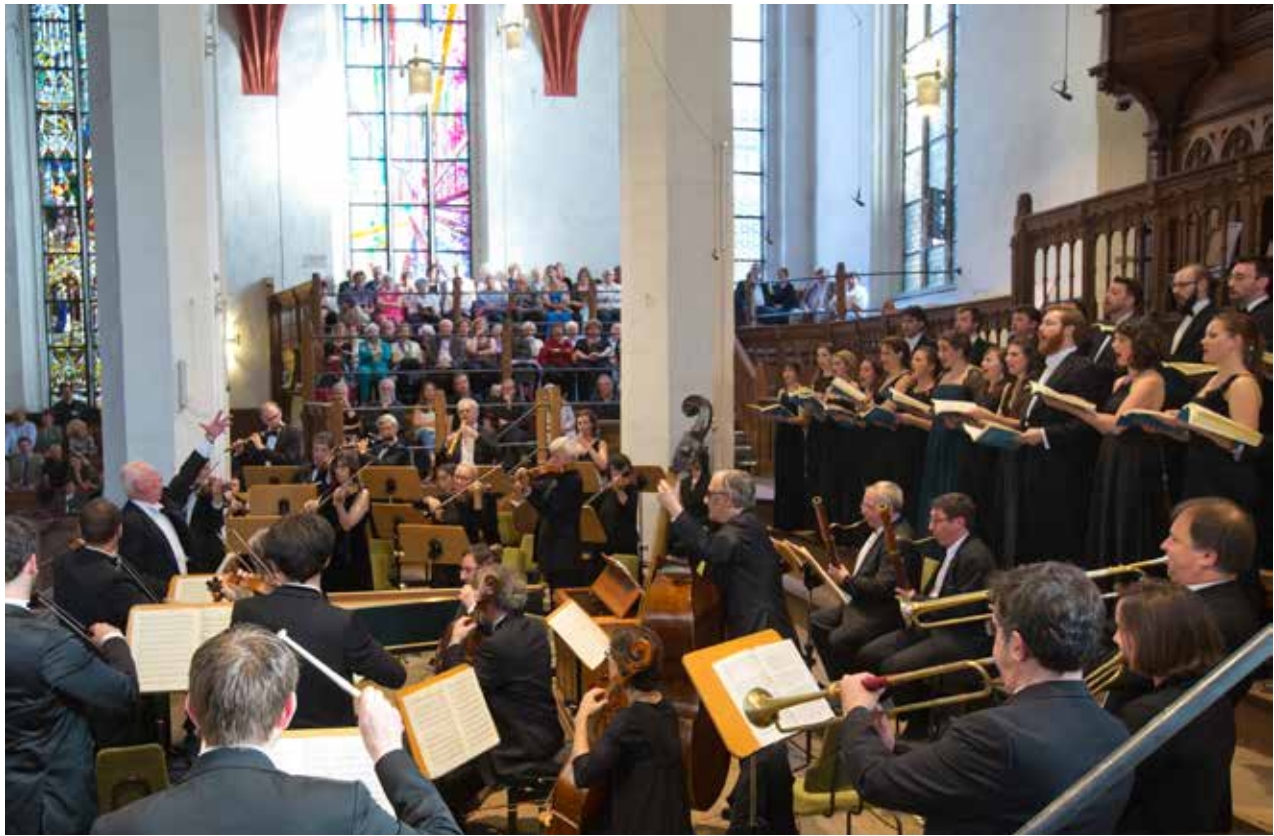
William Christie with Les Arts Florissants